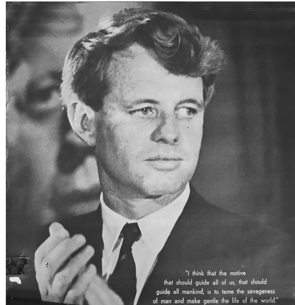
Bobby Kennedy died 52 years ago last June. At 12 yrs. old I was shocked into adulthood by his death. This was the poster I had up in my room for all of my teenage years. This aspiration is needed today.

"I think the motive that should guide all of us, that should guide all mankind, is to tame the savageness of man and make gentle the life of the world."